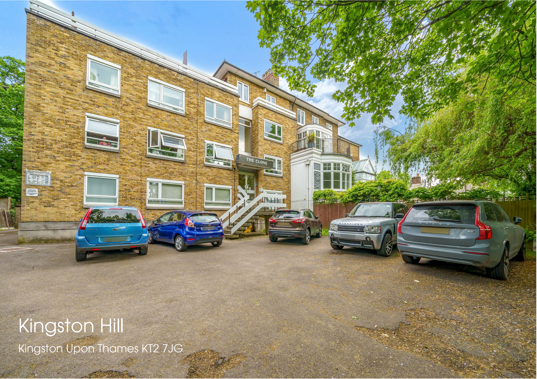
Kingston Hill Kingston Upon Thames KT2 7JG